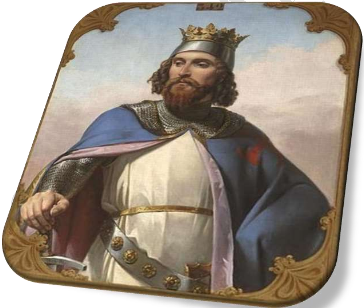
Roger I “Bosso” first count of Sicily (1031 – 1101)