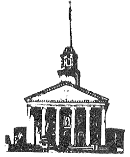
ART TREASURES IN ST. JOSEPH CATHEDRAL