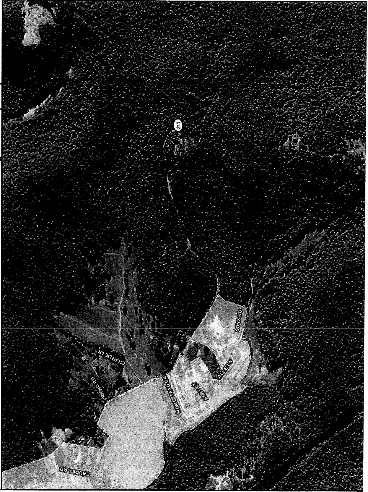
KY e-Clearinghouse Map Output